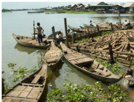
Canoes by pagoda at high water

The combination of Beng Mealea and Kompong Khleang is one of our most popular tours. If you only have time for one of our tours; take this one: It's a fantastic day!