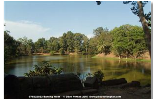
Rolus – Bakong Moat

Tour operates on any day required. Tour starts 7:30am pick up from your hotel 7:15am Cost: US$65 each for 2pax & $50 each for 3pax or more