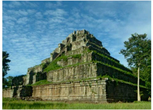
Prasat Thom Koh Ker

Beng Mealea is an absolutely fabulous place for those who want to see a vast and spectacular jungle temple in its raw un-restored state. Set within a moat of over 1 Sq Km; this temple is the most mysterious of all. Cloaked in vegetation with huge trees growing out of the ruins. Beng Mealea looks much as it did when first discovered. For those who take time out to visit; Beng Mealea and Koh Ker the highlight of a journey in Cambodia.