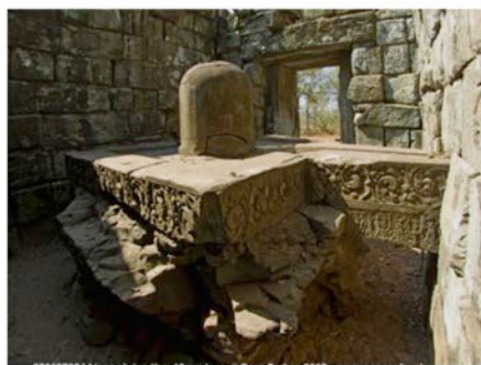
Prasat Balang: Linga shrine