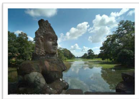
Angkor Thom Moat

I wrote this after my first visit in 2002. Ta Prohm and the temples have changed a lot in the last few years and visitor numbers have increased. In spite of this; Ta Prohm is one of the Wonders of Cambodia and is justifiably near the top of places to see here!